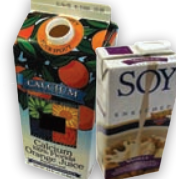
Paper milk/ juice cartons (no foil pouches, do not flatten)