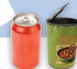
Cans (do not crush or flatten)

You can now place all recyclables in one bin!