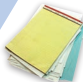
White or pastel office paper