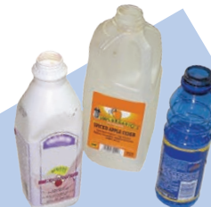
#1-7 Plastic Bottles