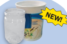
#1-7 Plastic tubs & screw-top jars (no lids, no #7 PLA compostables, do not flatten)

NO Plastic Bags • Plastic Tops • Shredded Paper • Hard-Back Books • Scrap Metal • Tyvek® Envelopes • Plastic 6-Pack Holders • Needles or Syringes • Paper Ream Wrappers • Plastic Microwave Trays • Frozen Food Containers • Mirrors, Ceramics or Pyrex® • Light Bulbs, Plates or Vases • Drinking Glasses • Window Glass • Hazardous or Bio-Hazardous Waste • Plastics Other Than Those Listed • Tissues, Paper Towels, Napkins • Waxed Paper or Waxed Cardboard • Stickers or Sheets of Address Labels • Kraft® (orange/brown) envelopes Styrofoam® or Paper To-Go Containers